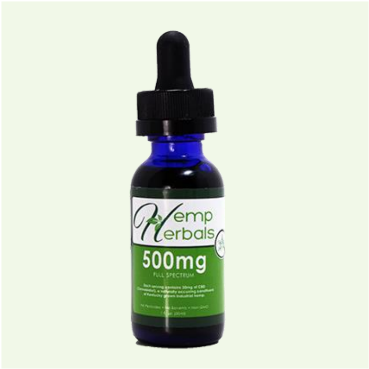
Hemp Herbals 500mg $69.95 – 50 CV