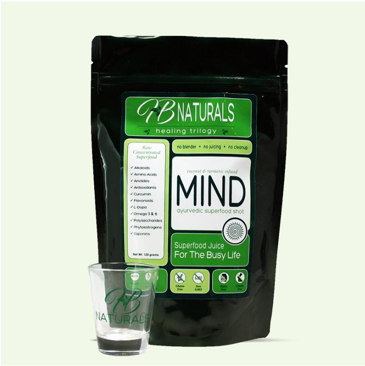
MIND $49.95 – 50 CV