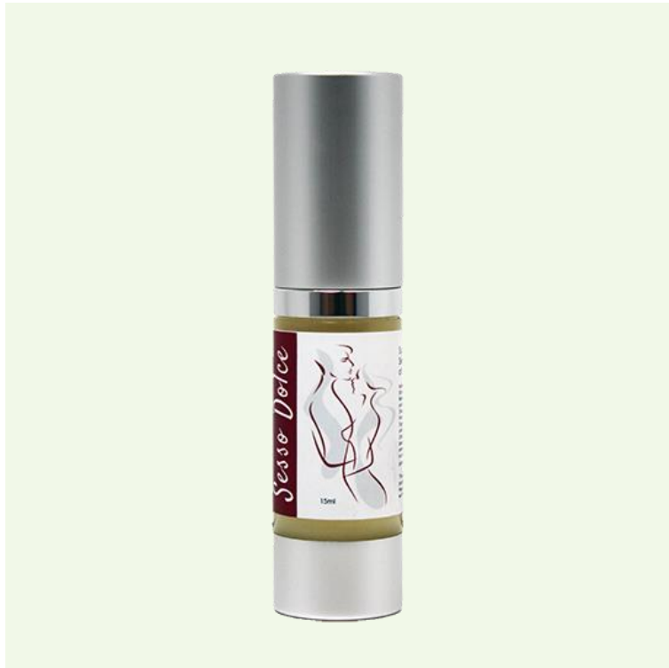
SESSO DOLCE $25.00 – 25 CV

9:00 am to 5:00 pm EST Monday through Thursday (513) 274-2110