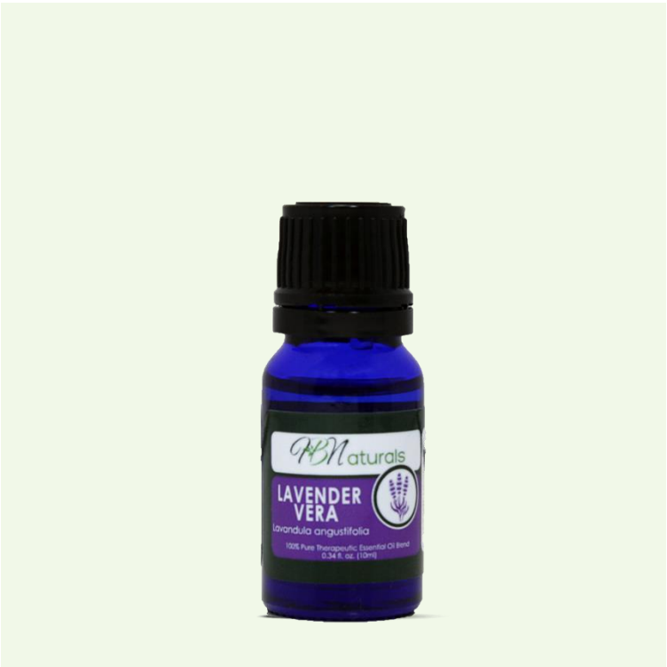
Lavender Vera $27.00 – 25 CV