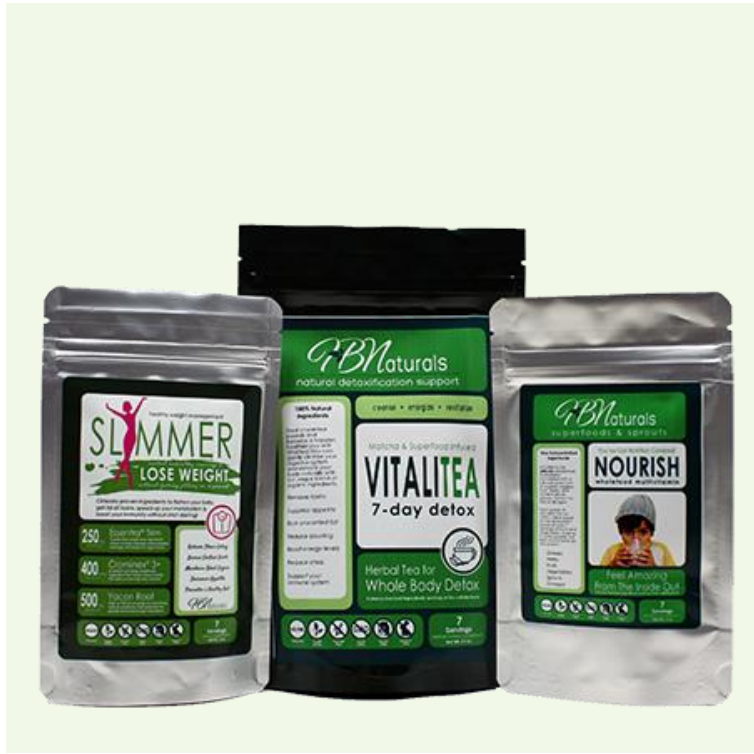
Weight Loss 7-Day $50.00 – 50 CV