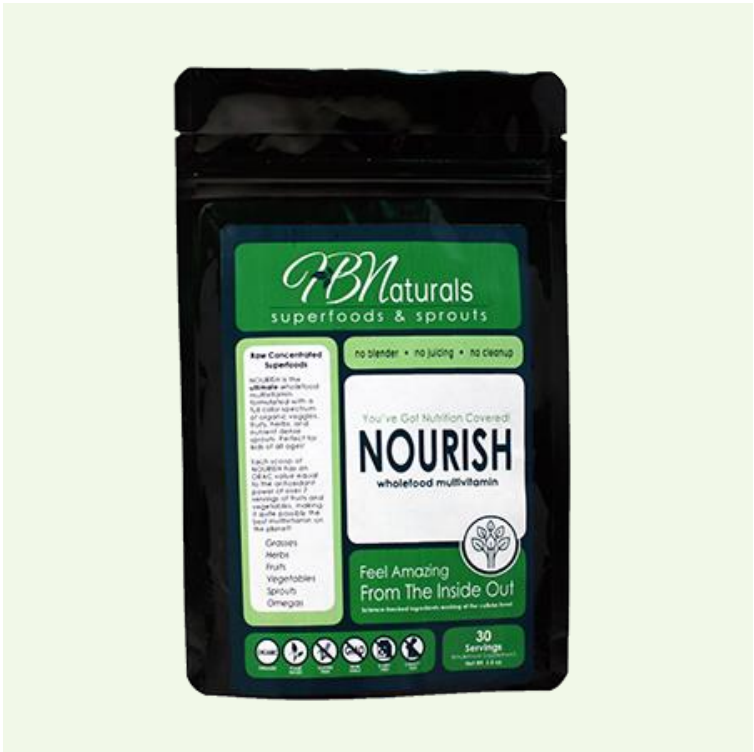
NOURISH $29.95 – 25 CV